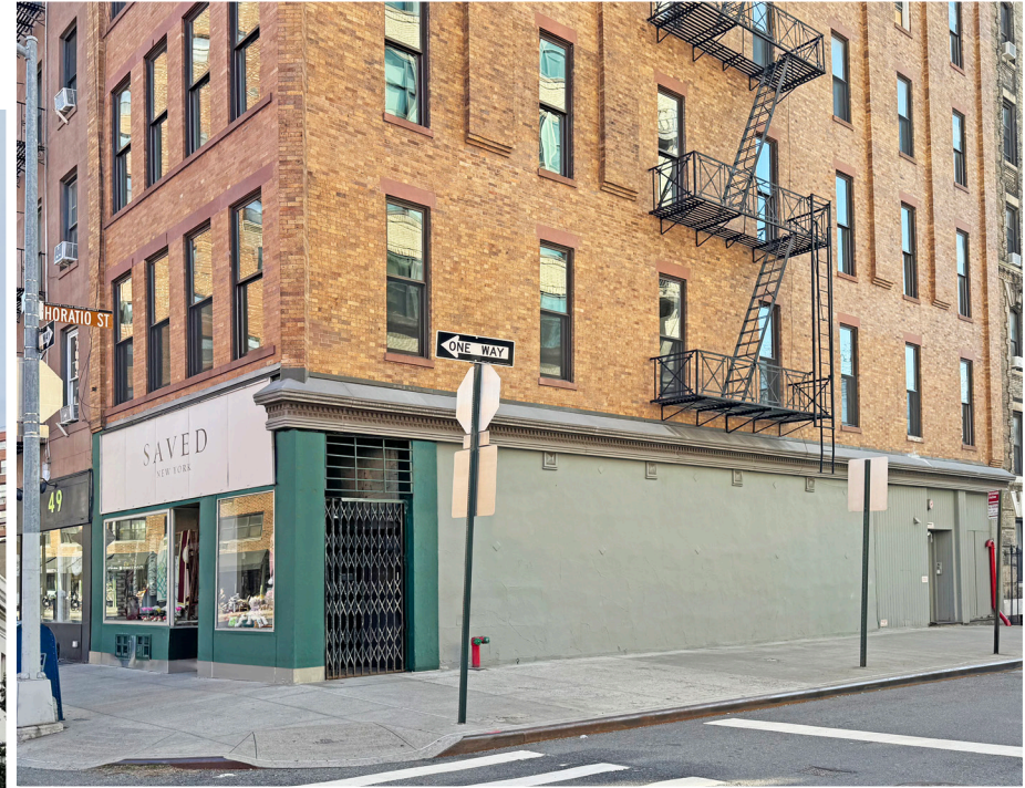
Rendering of possible façade